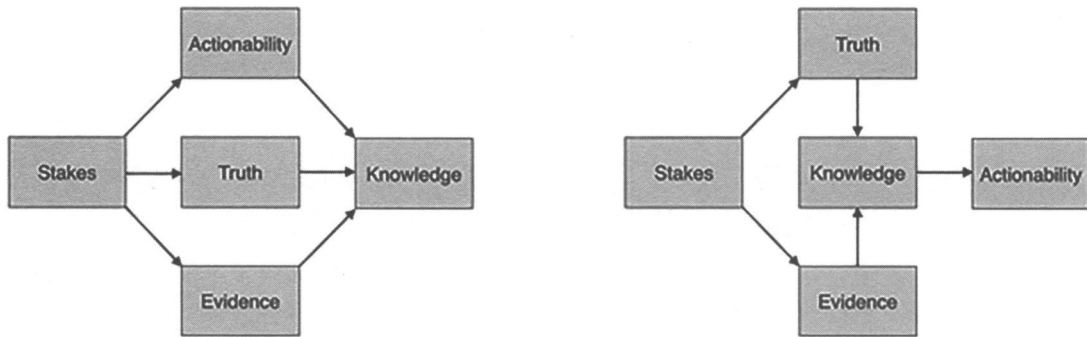
Figure 2. Two possible Lockean models of knowledge consistent with our results on knowledge judgments. On the left, a model showing knowledge constituted by actionability, truth, and evidence, with the relation between stakes and knowledge entirely mediated by the three constitutive factors. On the right, a model showing actionability constituted by knowledge, knowledge constituted by the traditional factors of truth and evidence, and the influence of stakes on knowledge entirely mediated by truth and evidence.

explains actionability in terms of knowledge. On this approach, although knowledge is entirely constituted by non-practical factors, it functions as an important norm of action. For instance, one might propose that knowing information necessarily suffices for appropriately acting on that information. This, too, could explain the link between actionability and knowledge judgments.